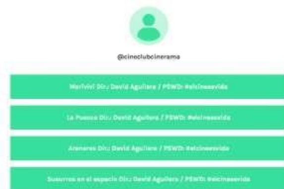
Linktree of different films on display at El Cinema club

once underestimated spaces. the virtual; where they have overturned the entire process of promotion, creation, and dissemination of content, which has allowed them to explore new digital tools. Faced with the challenges of virtuality, for Moisés the greatest innovation has not been the platforms, nor digital tools necessary for virtuality and remoteness since these already existed, but the very fact that has motivated their use, the need to make a transition from public training spaces to these spaces.